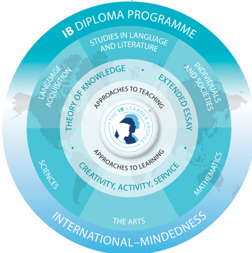
The Diploma Programme model